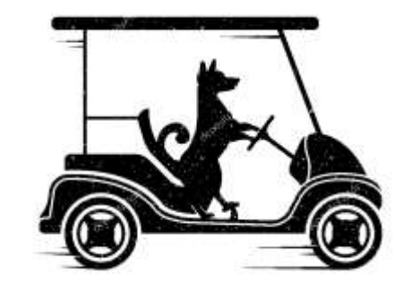
Golf Carts are allowed. Please drive slowly!!